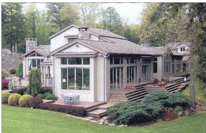
A property on Minor Bridge Road in Roxbury, Conn.

“I love what I do. It’s my business and my time. There is a lot of